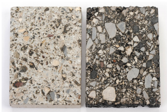
Figure 4: Green concrete with reclaimed bituminous (left) and tar asphalt (right).

CINDERELA focuses primarily on construction works (that is, building and civil engineering works (European Parliament and the Council, 2011)) with the application of SRM-based construction products and materials such as recycled aggregates (aggregates from recycled CDW), manufactured aggregates (aggregates from recycled industrial waste, originating from processes involving thermal or other modification), building composites (such as green concrete (Figure 4) with recycled and manufactured aggregate, geotechnical composites using sewage sludge and other wastes (Figure 5), asphalt with addition of aggregate from reclaimed asphalt) and recycled soil originating from selective excavation of soil. For the recycled wastes, CINDERELA defines a set of end-of-waste (EoW) criteria (such as limiting values of elements in leachate from composites) for different intended use of final products. As a measure stimulating the demand side of the CinderCEBM, the criteria will be incorporated into the CinderOSS.