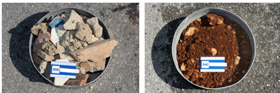
Figure 3: Visual appearance of mixed CDW (waste code 17 09 04 from LoW), and soil and stones (waste code 17 05 04) from Slovenian and Croatian case studies.

Another important consideration for establishing key business processes related to CinderCEBM is the valorisation of waste potential for recycling into SRM-based construction products. CINDERELA is developing a set of criteria for the recycling of waste into SRM-based products for different intended uses in construction works, such as composition, quantity, quality, availability and recyclability of waste. For three case studies (Maribor with surrounding municipalities in Slovenia, Istria in Croatia and the Madrid – Henares corridor in Spain) laboratory testing of the selected waste (Figure 3) was performed in order to valorise their potential as SRM for the construction sector.