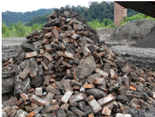
Figure 1: Construction and demolition waste (CDW) is one the most voluminous waste streams in the urban environment.

In support of the CinderCEBM, circular business model, the project is developing a multiservice CINDERELA “one-stop-shop,” called CinderOSS. CinderOSS combines many different services that can help entrepreneurs implement and accelerate their waste-to-construction product circular business model, as well as helping governments and other stakeholders in participating or stimulating these business models. CinderOSS offers information on product development services, market creation, including complementary measures, proposals for new regulatory and administrative procedures and information about the production and construction of circular construction products with the associated Building Information Modelling (BIM) libraries. Finally, CinderOSS will include a digital marketplace called the CINDERELA Digital Business Ecosystem (CinderDBE), where waste-to-product flows are traced, offering transparency and an efficient environment for stakeholders to meet and trade materials.