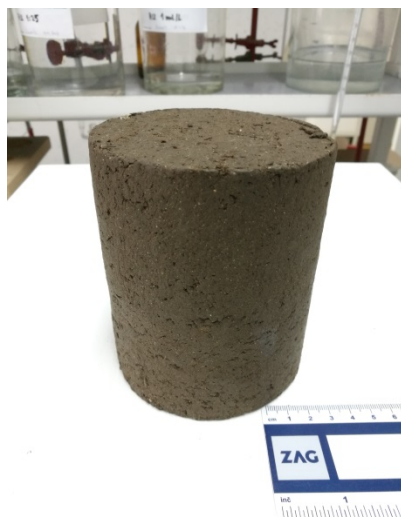
Figure 5: Composite from sewage sludge and ash.

Laboratory test data of SRM-based construction products will serve a double purpose; firstly, to design and establish modular as well as mobile pilot production plants for recycled and manufactured aggregates, building composites and recycled soils, and secondly, to demonstrate their use in large scale pilot demonstrations involving geotechnical works for revitalisation of a degraded area, construction of small scale facilities and for road construction. To build trust and encourage designers of and investors in construction works to use SRM-based products, BIM libraries will be developed. They will include all relevant data on SRM-based construction products (including mechanical properties, type of incoming materials, chemical and mineralogical composition, and environmental impact) to enable the use of the BIM tools for designing, constructing, managing and demolishing (reuse and recycling) of construction work with SRM-based materials during their life span. Through BIM, the CINDERELA pilot demonstrations, which will be built in Slovenia, Spain and Croatia, will showcase the added value of using SRM-based construction materials compared to traditional raw material based products.